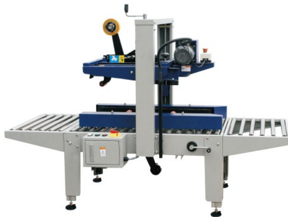
CS MH 1A MINI